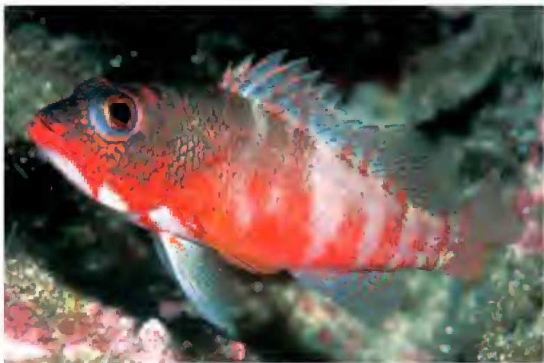
FIGURE 3. The most common color pattern of Serranus pulcher , near Santana Islet, São Tomé.